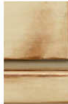
Burnt Umber Glaze over Antique White Milk Paint