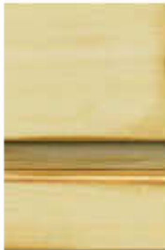
Yellow Ochre Glaze over Antique White Milk Paint