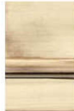
Van Dyke Brown Glaze over Antique White Milk Paint