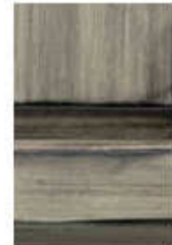
Pitch Black Glaze over Antique White Milk Paint