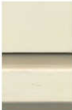
Winter White Glaze over Antique White Milk Paint