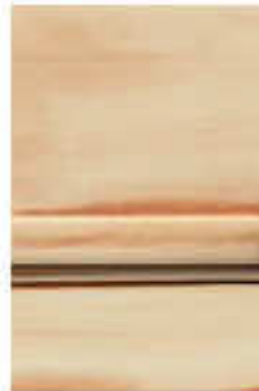
Red Sienna Glaze over Antique White Milk Paint